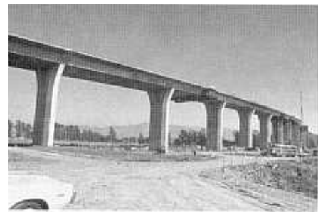
Figure 2 Napa River Bridge

alternatives to the bidders as possible. The design assumptions for structural lightweight concrete creep and modulus of elasticity were obtained from historical data maintained by the manufacturer.