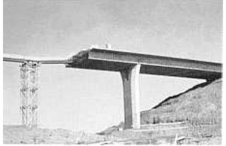
Figure 1 Napa River Bridge during construction.

This bridge is not only an economical alternative in direct competition with structural steel but is an aesthetic award winner in national competition. It has been inspected annually since 1977 and there are no apparent problems with the structural lightweight concrete.